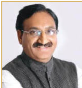
रमेश पोखरियाल 'निशंक' मानव संसाधन विकास मंत्री

स्टार्ट-अप इंडिया भारत सरकार की एक प्रमुख पहल है, जो नवीन आविष्कारों को हाथ में लेने, सहायता और प्रोत्साहनों के वित्त पोषण, उद्योग-शैक्षणिक भागीदारी और इन्क्यूबेटरों के बुनियादी स्तंभों पर आधारित है।