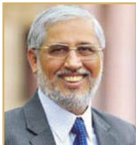
Anil D Sahasrabudhe Chairman, AICTE

I am very happy to see that the detailed guidelines have been issued by Ministry of Human Resource Development on National Innovation and Startup Policy for students and faculties of higher education institutions which further strengthens the Startup Policy released by All India Council of Technical Education in November 2016 from Rashtrapati Bhawan, just after few months of Startup action plan announced by the Government of India in January 2016.