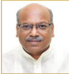
Sanjay Shamrao Dhotre Minister of State for Human Resource Development

India aspires to become a 5 trillion dollar economy in a near future. To reach this mark, it needs to evolve system and mechanisms to convert the present demographic dividend into high quality technical human resource, capable of doing cutting edge research and innovation, and deep-tech entrepreneurship. At this juncture, the MHRD's Innovation Cell and AICTE have brought out the 'National Innovation and Startup Policy 2019' for students and faculty.